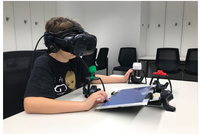
Figure 2: Study setup: a child is wearing VR glasses as an instantaneous output for the input provided by tangibles and a tablet. New virtual objects are created by placing tangibles on the tablet surface and can be modified via touch input.

Trajectory creation. We employed trajectory creation to allow the movement of virtual objects on the 2D surface. With this, we aimed to showcase one possibility to interact with dynamic elements in VR. In the trajectory mode, the object starts moving with a constant speed when a finger is released from the touch surface after drawing a trajectory. A user can start drawing a trajectory by touching anywhere on the surface. This mode also allows a simultaneous movement of multiple dynamic objects. For example, a user selects a car in the virtual scene, draws a trajectory for it and it starts moving in the scene. While the first car is moving, a user can select another car and specify a second trajectory and let the car move. One object is, however, restricted to a single trajectory. If users want to change an existing trajectory, they have to draw another trajectory for a selected object and the previous trajectory will be deleted. The trajectory is visually depicted in the scene and disappears when a dynamic object finishes the trajectory. Given that the trajectory is connected to the world, it moves together with it in the scene control mode.