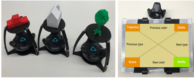
Figure 1: Inputs of the VRtangles: three tangible objects on the 3D-printed platform (left) and a tablet as an interaction surface (right). The tablet is overlaid with a VR interface. The tangible objects and a tablet are tracked in the virtual space using VR trackers.

a tablet. Tangible objects are used to create virtual objects in the scene and can be further granularly modified using touch input.